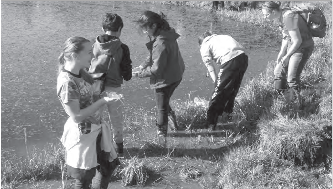
White Salmon Valley Education Foundation funds pay for several educational programs, including a field trip to the Snowden Wetlands.