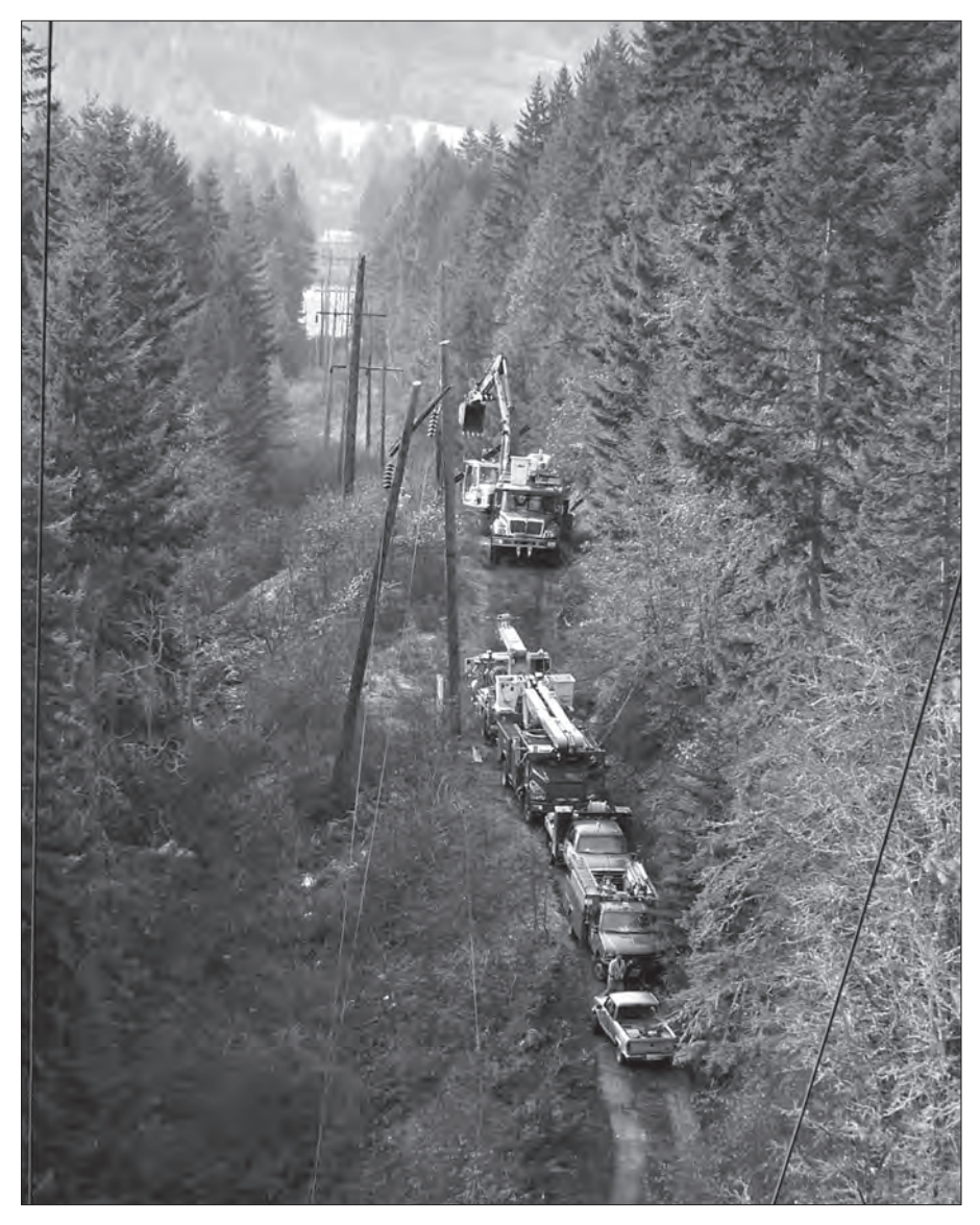
KPUD line crews work on a transmission outage in one of the most remote stretches of line in the county: the Glenwood transmission line.

Power restoration takes precedence over a lineworker's daily to-do list. These brave men are always on call. Crews stand by to serve you 24 hours a day, in the middle of the night or wee hours of