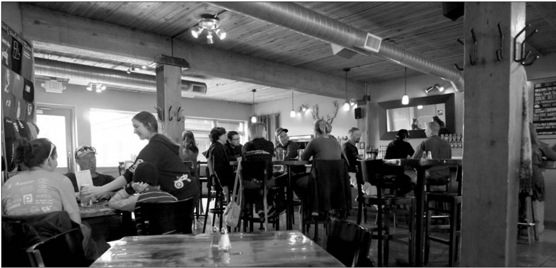
Left, diners enjoy a late lunch at Everybody's.