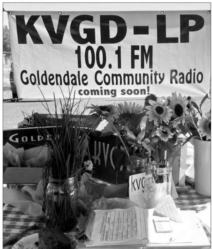
Radio station supporters hosted a table with information about the radio station at the Goldendale Farmers Market last summer.

"So this is really a labor of love," she says, laughing. ■