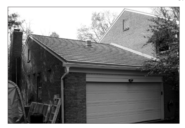
A completed garage metal roof with matching trim and flashing.

► Met-Tile (909) 947-0311 www.met-tile.com. ■