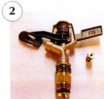
New brass impact sprinkler with new brass nozzle