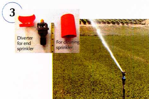
Low pressure rotating sprinkler to replace impact sprinkler (example shown of 'wind fighter' sprinkler by Nelson)