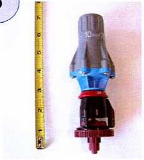
Nelson rotator or spinner

Low pressure regulator with rotating or wobbling pivot sprinkler