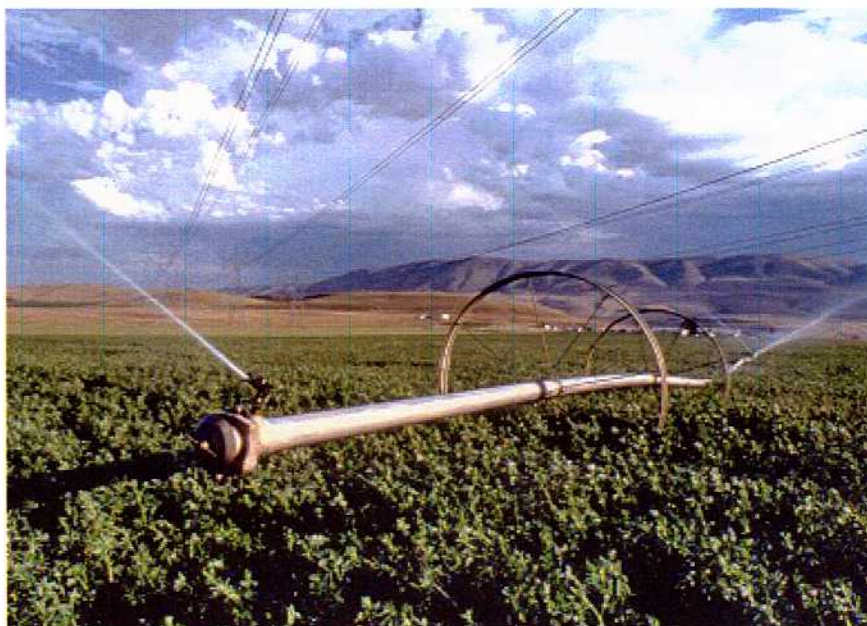
A wheel-line irrigation system can be modified to be more efficient.

Note: Not all utilities will offer rebates for all equipment or measures described in this document