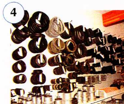
Wheel line gasket